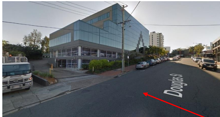
Driveway for Car Park